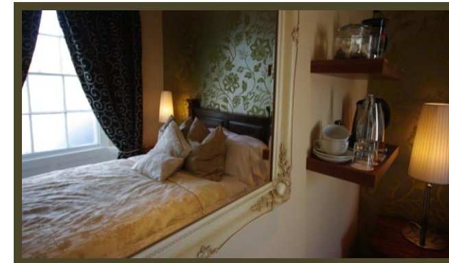
The Louis Room, offers peace & quiet

Every room has its own character from slightly sloping 500 year old floors to original beams. Please feel free to ask for a nosey in our available rooms, just ask a member of staff & we will be happy to give you a tour.