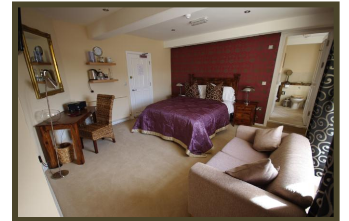
The Windsor Suite, with views of the local church

All of our rooms have been individually designed to the highest standard & all have the latest gadgets including, DVD's, flat screen TV's free view & iPod docking stations. Breakfast is served from 7am Monday to Friday, and from 9am on Saturday & Sunday.